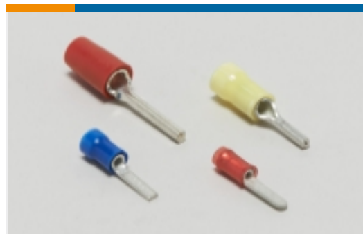
Crimp Wire Pins, Tabs & Ferrules(3)