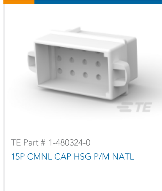
TE Part # 1-480324-0 15P CMNL CAP HSG P/M NATL