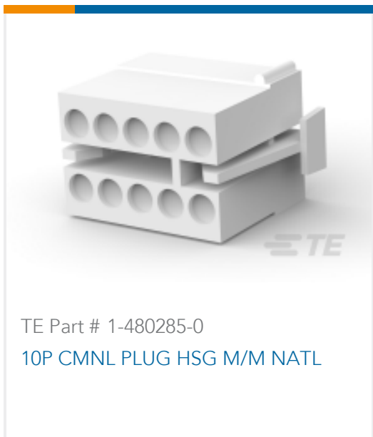
TE Part # 1-480285-0 10P CMNL PLUG HSG M/M NATL