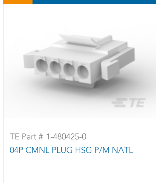
TE Part # 1-480425-0 04P CMNL PLUG HSG P/M NATL