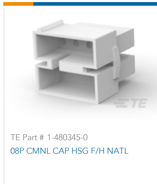
TE Part # 1-480345-0 08P CMNL CAP HSG F/H NATL