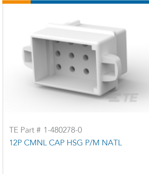
TE Part # 1-480278-0 12P CMNL CAP HSG P/M NATL