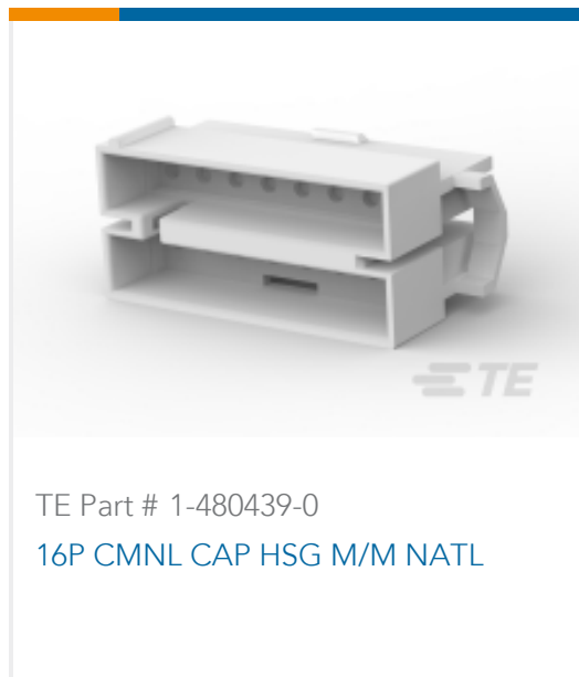
TE Part # 1-480439-0 16P CMNL CAP HSG M/M NATL