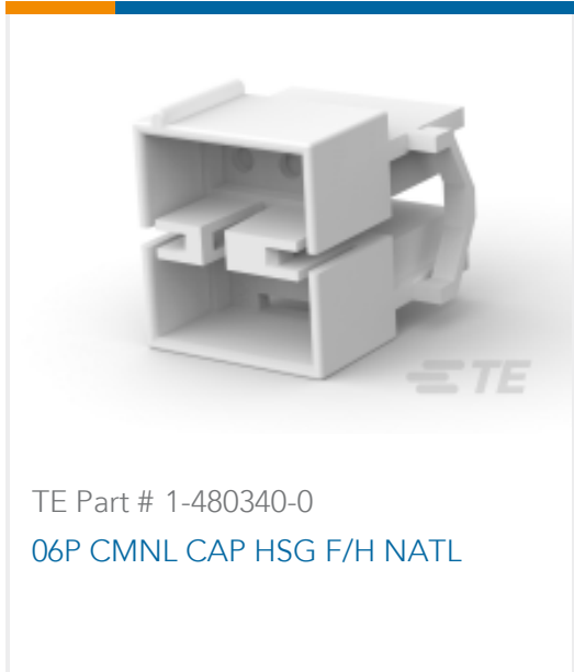
TE Part # 1-480340-0 06P CMNL CAP HSG F/H NATL