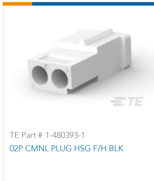
TE Part # 1-480393-1 02P CMNL PLUG HSG F/H BLK